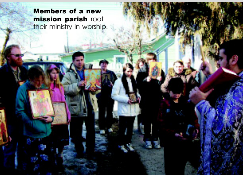
Members of a new mission parish root their ministry in worship.

People come to the Church motivated by all kinds of reasons – club affiliation, social or athletic activities, “religious insurance,” ethnic interests, marriage, baptism, burial, whatever – and they leave just as readily, being motivated by some minor whim, displeasure, or other reason. Christ did not come into the world and die for that. His mission – a mission for which He literally gave His life – was to manifest the nature of God and to bring mankind to God in a deep inner way, enabling us thereby to change our way of life – first in terms of our own personal state of being, and then in terms of our relationships with other human beings and all of creation. This is why the Church exists. This is why the Church, when it ceases to be missionary, ceases to be the Church, the Body of Christ, the very presence of the Kingdom of God in the world – the Kingdom that, while yet to be fully revealed, is already fully present to all who would embrace and share it. ■