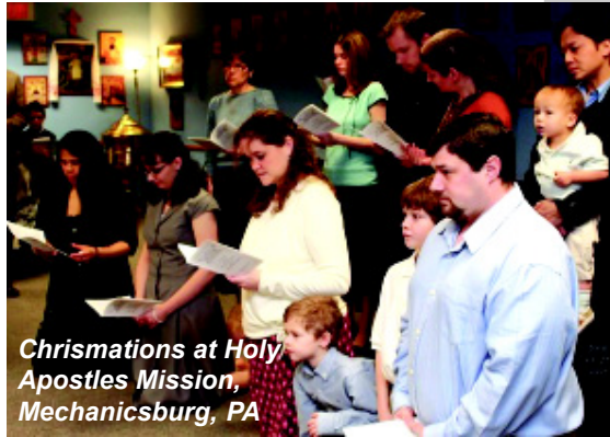
Chrismations at Holy Apostles Mission, Mechanicsburg, PA

In the past decade, your generous gifts to the OCA's annual Mission Appeal have provided Church Planting Grants to over two-dozen fledgling missions – most in regions with little or no Orthodox presence – that have been “harvested” into thriving parishes today. So much more can be done if we respond to one “very basic truth, that the