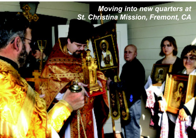
Moving into new quarters at St. Christina Mission, Fremont, CA

Church is essentially mission,” as the late Fr. Alexander Schmemmann observed, “that the very roots of her life are in the commandment of Christ: Go, therefore, and teach all nations.”