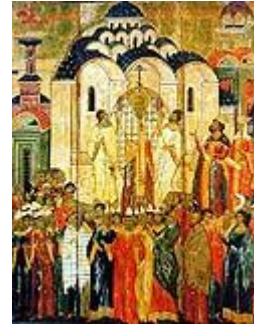
Afterfeast of the Elevation of the Cross