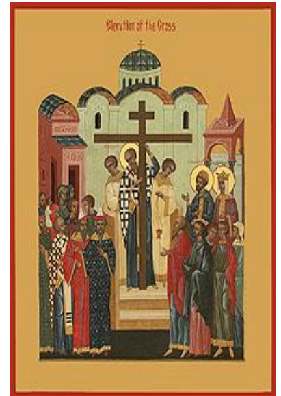
Afterfeast of the Elevation of the Cross

From September 15 until the Leavetaking, we sing “O come, let us worship and fall down before Christ. O son of God crucified in the flesh, save us who sing to Thee: Alleluia” at weekday Liturgies following the Little Entrance.