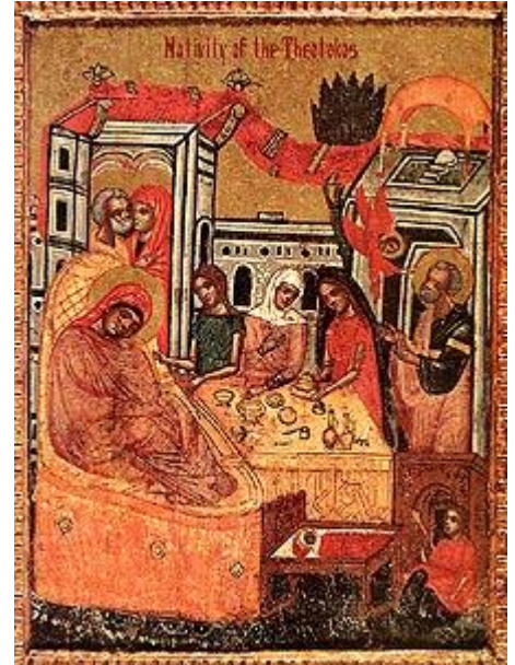
Afterfeast of the Nativity of the Theotokos

By Your Nativity, O Most Pure Virgin, / Joachim and Anna are freed from barrenness; / Adam and Eve, from the corruption of death. / And we, your people, freed from the guilt of sin, celebrate and sing to you: / The barren woman gives birth to the Theotokos, the nourisher of our life!