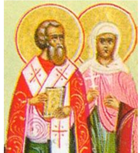
Hieromartyr Zenobius and his sister Zenobia, of Aegæ in Cilicia (285)

Let us honor with inspired hymns the two martyrs for truth: / the preachers of true devotion, Zenobius and Zenobia; as brother and sister they lived and suffered / together and through martyrdom received their incorruptible crowns.