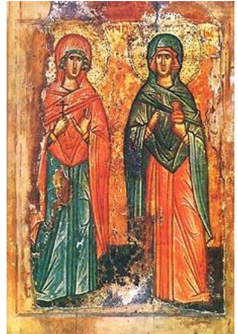
Martyr Anastasia the Roman

Purified by the waters of virginity, / righteous Anastasia, you were crowned by the blood of martyrdom. / You grant healing and salvation to those in need, / and who call on you from their hearts, / for Christ gives you strength, pouring out on you ever-flowing grace!