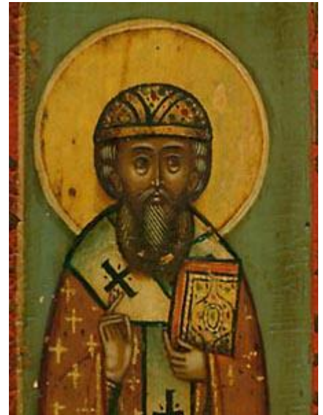
St. Abercius the Bishop and Wonderworker of Hieropolis, Equal of the Apostles

All the Church honors you, Abercius, / The Great Bishop equal to the Apostles! / O blessed one worthy of all praise, / Through your intercession / Keep the Church victorious, calm and unshaken.