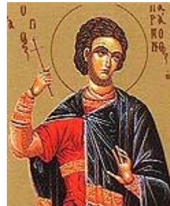
Martyr Paramon in Bithynia.