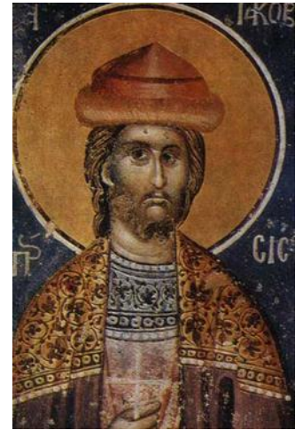
Greatmartyr James the Persian

You listened to your faithful wife / and contemplated the judgment of God, holy James; / you despised the threats and commands of the Persians, / accepting the cutting of your body as though you were a vine. / Therefore you were revealed as a martyr worthy of honor.