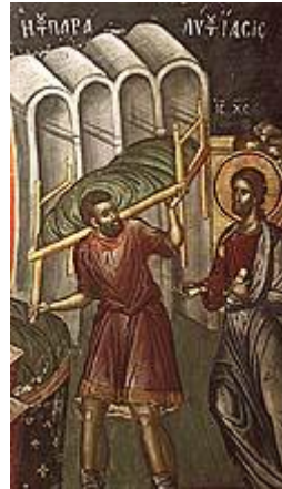
Sunday of the Paralytic

4 th Sunday of Pascha; Sunday of the Paralytic