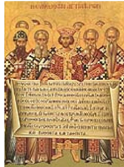
Holy Fathers of the First Ecumenical Council.

7th Sunday of Pascha; Holy Fathers of the First Ecumenical Council. Afterfeast of the Ascension.