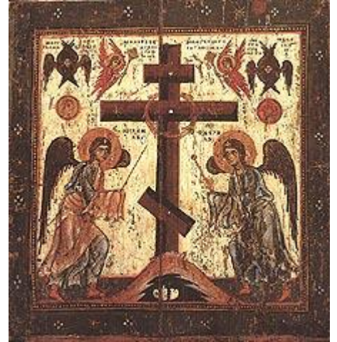
3rd Sunday of Great Lent: Veneration of the Cross

Now the flaming sword no longer guards the gates of Eden; / it has mysteriously been quenched by the wood of the Cross! / The sting of death and the victory of hell have been vanquished; / for You, O my Savior, have come and cried to those in hell: / "Enter again into paradise."