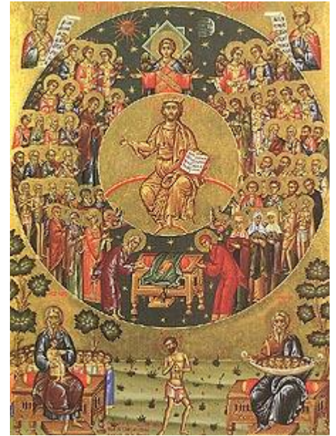
Synaxis of All Saints

The universe offers You the God-bearing martyrs, / As the first fruits of creation, O Lord and Creator. / Through the Theotokos, and their prayers establish Your Church in peace!