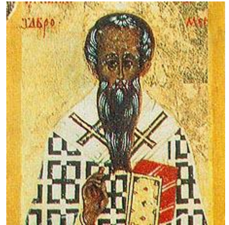
Hieromartyr Pancratius, Bishop of Taormina in Sicily (1st c.).

You were a brilliant star in Taormina, O blessed Pancratius, / And You became a hieromartyr for Christ. / Standing before Him now, pray for those who honor you.