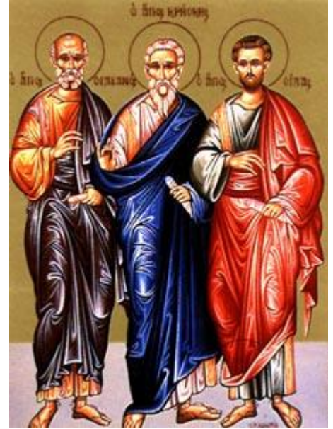
Apostles Silas and Silvanus of the Seventy, and those with them: Crescens, Epenetus, and Andronicus

You were revealed to be branches of the vine of Christ, O wise ones, / bearing clusters of virtues that pour out on us the wine of salvation. / Receiving it, we are filled with gladness, / and we celebrate your most honored memory, apostles of the Lord, Silas and Silvanus. / Therefore, intercede that great mercy and remission of sins may be granted to us.