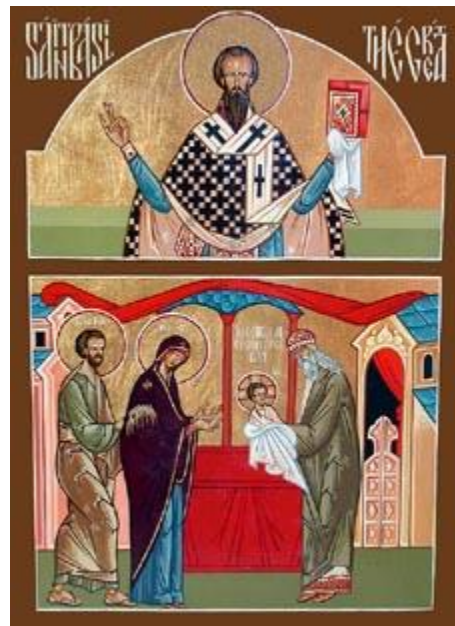
The Circumcision of our Lord and Savior Jesus Christ

The Lord of all accepts to be circumcised, / thus, as He is good, excises the sins of mortal men. / Today He grants the world salvation, / while light-bearing Basil, high priest of our Creator, / rejoices in heaven as a divine initiate of Christ.