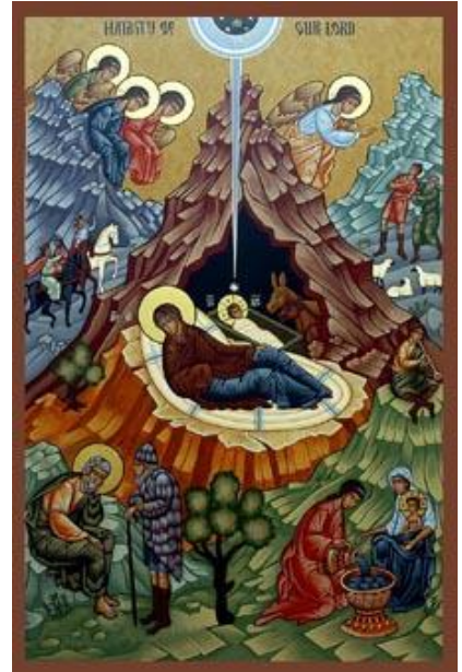
Sunday before the Nativity

(For when the Sunday before the Nativity falls on December 18-19) / You did not worship the graven image, / O thrice-blessed ones, / but armed with the immaterial Essence of God, / you were glorified glorified in a trial by fire. / From the midst of unbearable flames you called on God, crying: / Hasten, O compassionate One! / Speedily come to our aid, / for You are merciful and able to do as You will.