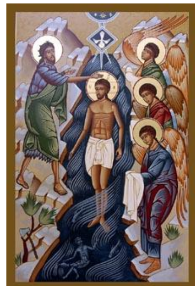
Afterfeast of the Theophany of our Lord and Savior Jesus Christ

Today the Lord enters the Jordan and cries out to John: / "Do not be afraid to baptize me. / For I have come to save Adam, the first-formed man."